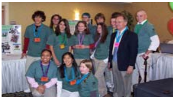
NH Congressman Charles Bass with members of the NH Youth Board of Volunteers.

With volunteering and public service so critical to improving our way of life, it's no doubt NH Congressmen Charles Bass and Jeb Bradley each decided to take time out of their busy pre-election weekend to address the conference participants. And, a letter from Senator John Sununu was read praising all of the young volunteers.