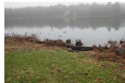
Lamprey's "Ice" Pond - the land the Earthkeepers will restore

The Seacoast Earthkeepers launched this Earth Day. The Team will be turning an overgrown area of Hampton into a community park by building trails, benches, removing invasive species, and celebrating the area's historical significance. They plan to involve the local community in the process of restoring the park.