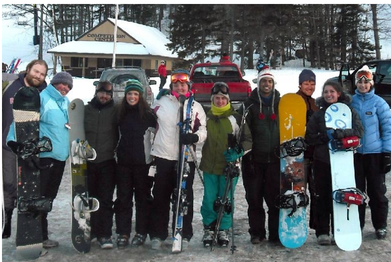
YVNE Staff at Mount Sunapee.