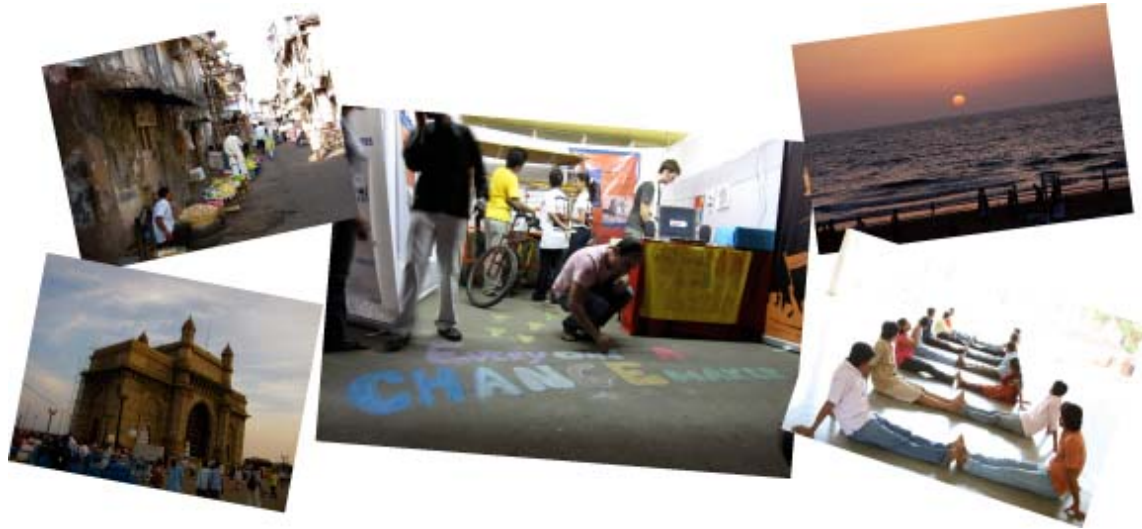
Left to Right: Vendors on Bazaar Road, Chalk art at Youth Lead, Sunset at Juhu Beach, Gateway of India, Venturers during an energizer at last workshop