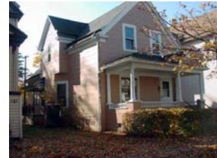
Buffalo BASICS rehabilitation house

Buffalo B.A.S.I.C.S. will provide a "back to the basics" comprehensive approach to home maintenance for residents in Buffalo, NY. The Team has already purchased a foreclosed house that they will rehabilitate and use to educated residents through workshops on home maintenance and gardening, improving their homes and property values.