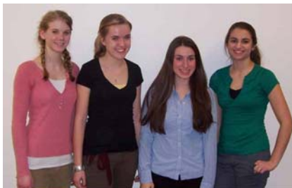
Ethics Forum at Selection Panel

Ethics Forum is the latest team to come out of the United Way of Greater Nashua with Nashua Community College partnership. The Team will raise money for Schools for Salone , a nonprofit that helps establish schools in Sierra Leone, Africa, through a series of fundraisers - including a benefit concert June 5, 2009.