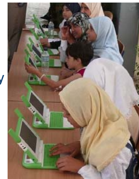
Kids using XO laptop provided by One Laptop per Child

One for All developed a plan for teachers in developing countries to integrate their curriculum with the use of laptops provided to them by One Laptop per Child , to ensure both students and teachers fully benefit from them. They hope to address and eliminate the technological inequities that will only grow more substantial in the future. The Team is fully supported by One Laptop per Child .